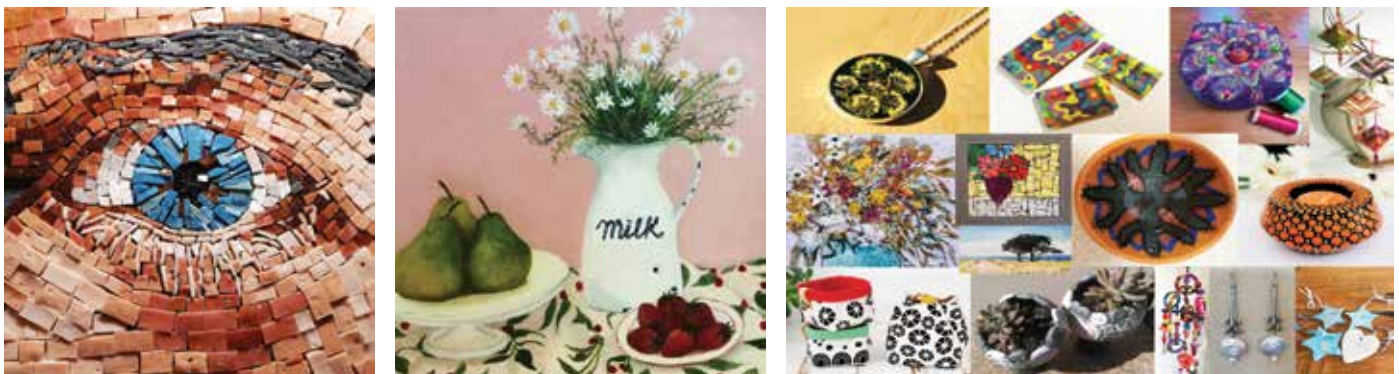
Image credits: Beate Linckelmann, Soul to the World , Mosaic. Christine Dry, Still Life , Oil. Little Treasures 2021 image collage

This much anticipated annual exhibition of gift oriented works includes wearable art, wall art, trinkets, silk, cards, sculpture, woodwork, ceramics, collage, jewellery, collage and more. A treasure trove of affordable handmade arts and crafts for Christmas.